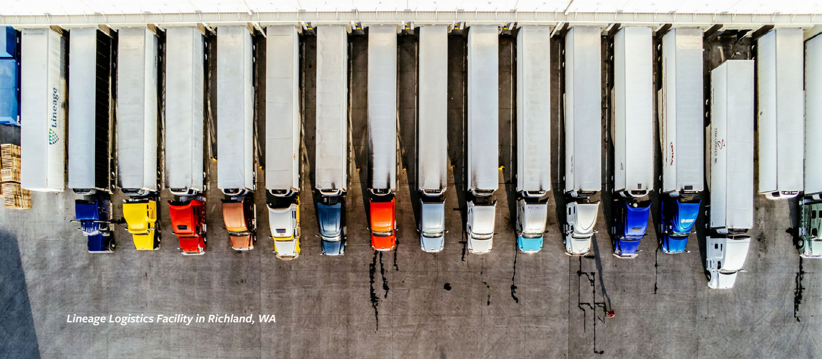
Lineage Logistics Facility in Richland, WA