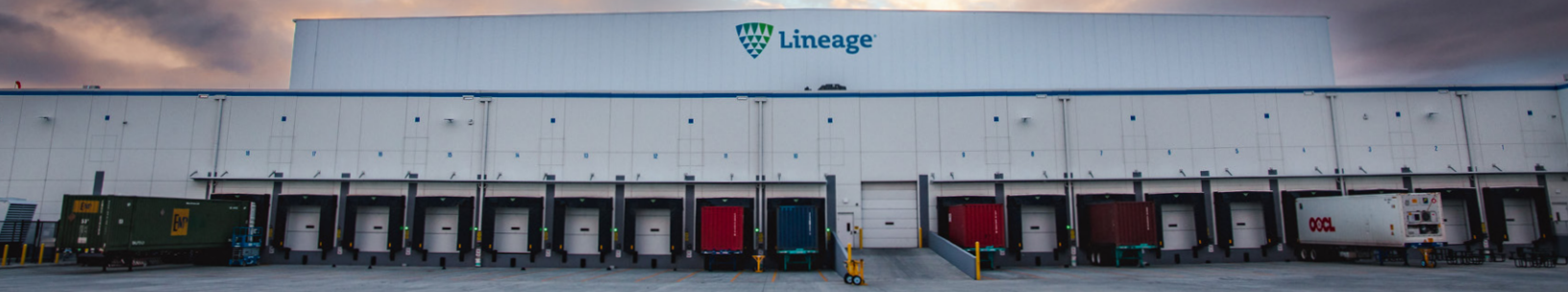
Lineage Logistics Facility in Portsmouth, VA

For better visibility and control of your cold chain right at your fingertips, choose Lineage Link®. Featuring a user-friendly online interface, Lineage Link® is available on any desktop or mobile device using an internet browser or via the mobile app. Contact a Lineage team member today to get started.